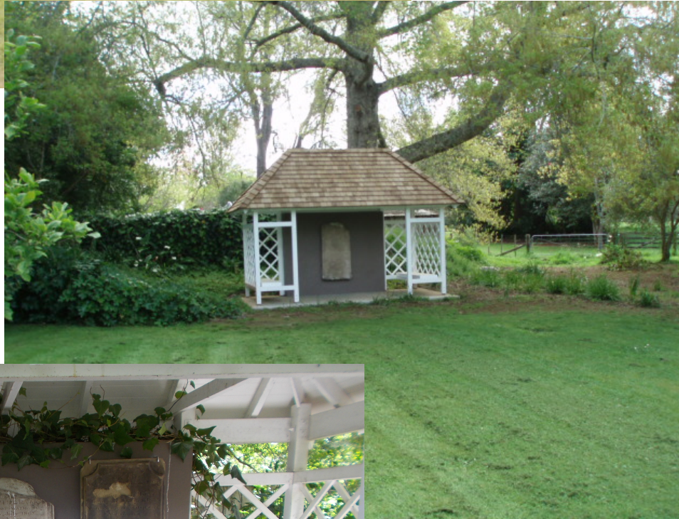
The pavilion in its garden setting with the tombstone