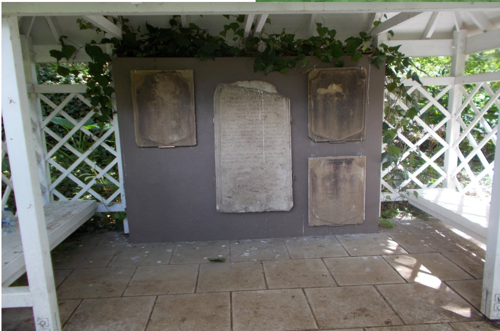
The tombstone and three memorial plaques